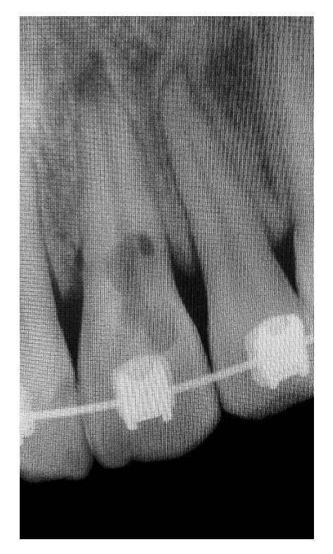
Figure 1 – Periapical radiograph of tooth 21 with internal tooth resorption and apical periodontitis following orthodontic treatment

Statistical analysis of the study results was carried out using computer programs Microsoft<sup>®</sup> Excel 2017 for Mac and the licensed package "Statistica 6.1". The critical level of significance in statistical hypotheses testing in this study was taken as equal to 0.05. Clinical symptoms and abnormalities during dynamic observation were recorded, but not subjected to statistical analysis.