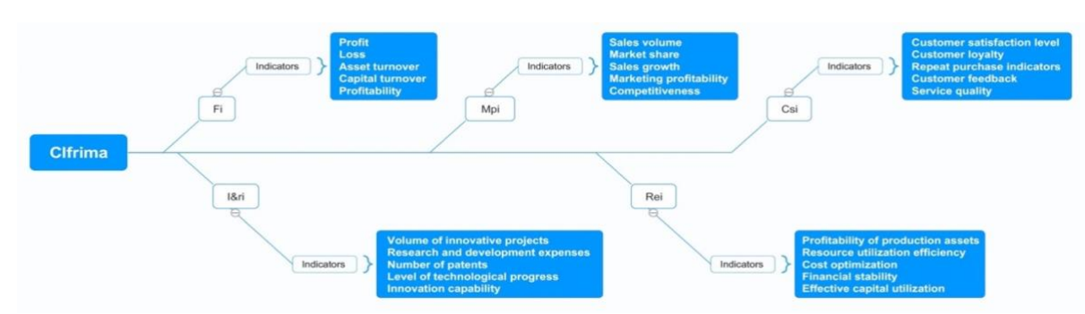
Figure 1. The structure of the effects of CIIFR components on international marketing activities

• Expert Involvement: Opinions were collected from experts, such as agricultural enterprise managers, international marketing specialists, and financial analysts, to assess the importance of each indicator. Over 30 experts from across Ukraine were involved and were asked to rate each indicator on a scale from 1 to 10, where 1 indicates low importance and 10 indicates high importance.