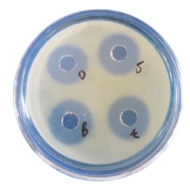
Fig. 1 The zones of growth retardation of the Escherichia coli laboratory culture of group 1b