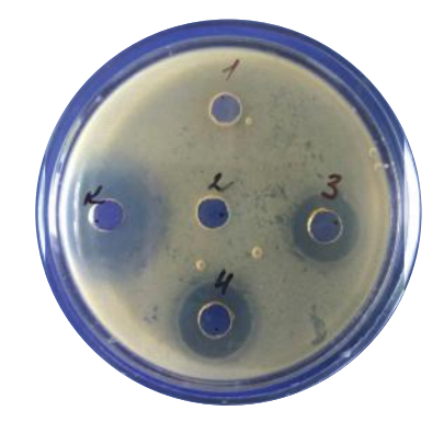
Fig. 3 The zones of growth retardation of the Escherichia coli laboratory culture of group 2b