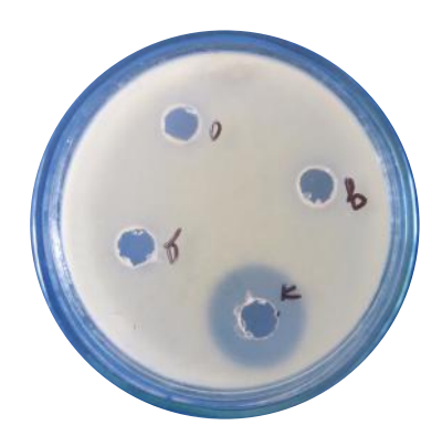
Fig. 6 The zones of growth retardation of the Escherichia coli laboratory culture of group 3a

study was not just on the inflamed sprout, but on the body with purulent content. And although this occurs, its removal, manipulation on it, including the intersection in the base area, took place under conditions of bacterial saturation with a variety of microflora <sup>6,11,13</sup> and purulent transformation, which inevitably, in a percentage of cases, is accompanied by infection with the crossing zone of the sprout and surrounding ones fabrics. It is clear why the postoperative period in a large part of the patients runs with a number of the above complications. At the same time, with the lymphotropic administration of the drug according to the proposed method, the hormonal sprocket after an hour accumulates an antibiotic in sufficient quantity (53,3 %) from the maximum possible inhibition of growth of the test culture observed with the introduction of a «pure antibacterial drug. Two hours later, the accumulation of the drug is practically no different from the control, which appears to be practically the same