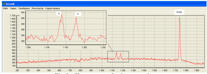
Fig. 2 – The spectrum of carbon nanotubes

tra should be of great luminosity, low levels of ambient light and a large variance. The spectrograph Sirius meets these requirements: it has a relative aperture 1:3, its optical scheme is based on holographic diffraction gratings with correction of aberrations and has a minimal number of optical components. The studies were conducted with a diffraction grating 1153gr./mm, which provides a working spectral range 486-680 nm. The spectrograph is equipped with a multichannel recording system based on the spectrum of the diode line with the number of pixels 2048 and a pixel size of 1914 * 150 microns. To suppress the laser beam in front of the entrance slit set Notch-filter [8]. In the experiments, spectra were obtained by surface-enhanced Raman scattering (SERS) on silver substrate. Figure 2 shows spectrum of carbon nanotubes obtained under the following conditions: laser power 200 mW at 532 nm with a Notch-filter, the relative aperture of 1:4, the width of the entrance slit of 50 microns.